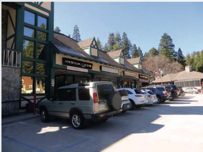
EXTERIOR OF THE PROPERTY