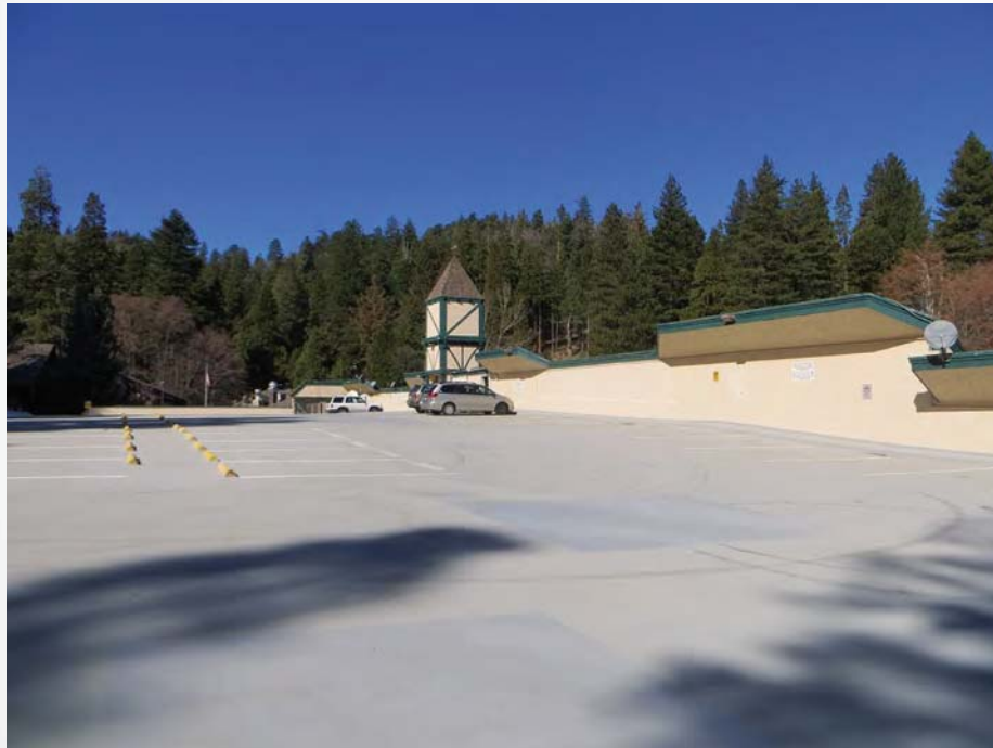
ADDITIONAL ROOFTOP PARKING

The information above was obtained from sources believed to be reliable. However, we have not verified its accuracy and make no guarantee, warranty or representation about it. It is submitted subject to the possibility of errors, omissions, change of price, rental or other conditions, prior sale, lease or financing, or withdrawal with notice. Any projections, opinions, assumptions or estimates are included for example only, and may not represent current or future performance. You and your tax, legal and other advisors should conduct your own investigation.